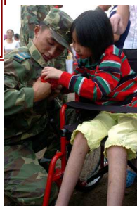
First batch of Soldiers leave China's quake zone

The Western media is not very sympathetic towards China. It will attack China if the Chinese people will now fail in their social obligations.