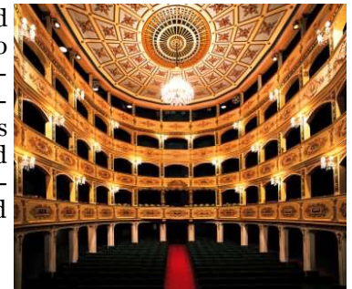
Manoel Theatre, Valletta—Malta

The three performing artists were brought together by chance, in September 2006, during a Sori-WOMAD festival in The Republic of Korea.