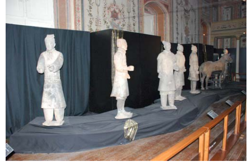
The Vivid Chinese Terracotta Warriors

The exhibition 'Silent Warriors -- The Chinese Terracotta Soldiers', held from 1 March to 31 July 2007, is organised by Heritage Malta and Shanxi Provincial Cultural Relics Bureau in collaboration with the Malta Ministry of Tourism and Culture, the Embassy of the People's Republic of China and the Chinese Cultural Centre in Malta